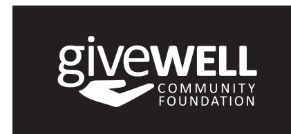
WHITE FORMAT ON BLACK BACKGROUND