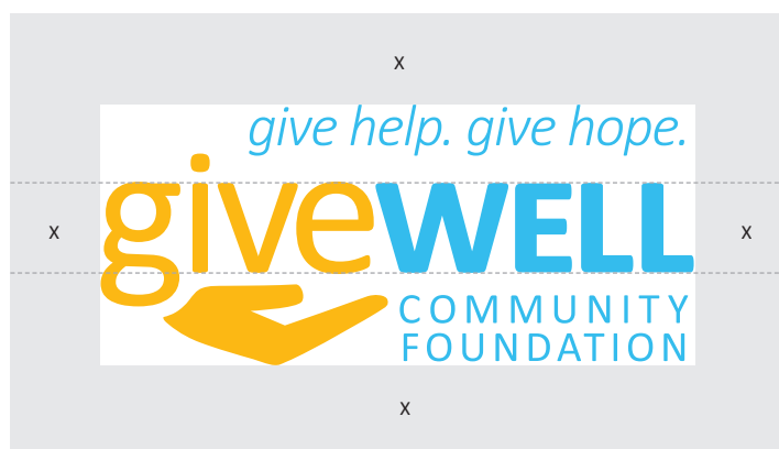
NAMEPLATE TAGLINE LOCKUP