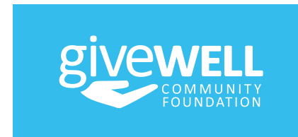
WHITE FORMAT ON BLUE BACKGROUND