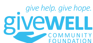
1-COLOR BRILLIANT BLUE FORMAT