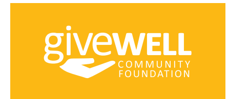
WHITE FORMAT ON GOLD BACKGROUND