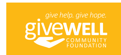
WHITE FORMAT ON GOLD BACKGROUND