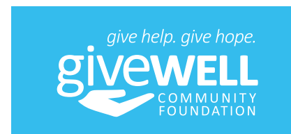
WHITE FORMAT ON BLUE BACKGROUND