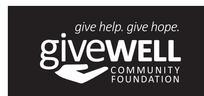
WHITE FORMAT ON BLACK BACKGROUND